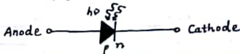
Fig. 1 :- Symbolic representation of a photodiode

It is a p-n junction diode fabricated with a transparent window so that light can fall on its junction. Its symbolic representation is shown in fig. 1.